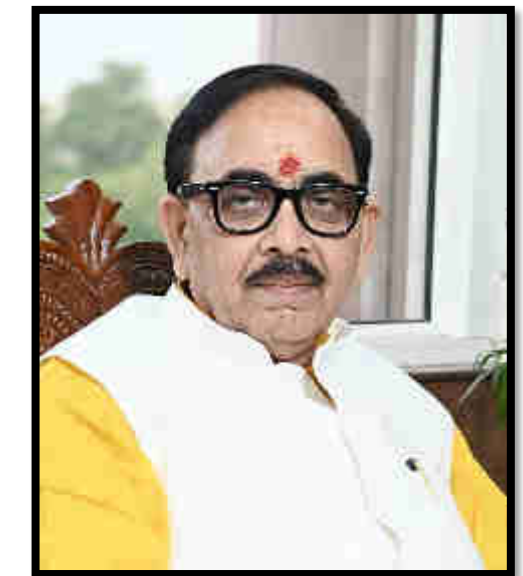
Dr Mahendra Nath Pandey

Please note, while COVID-19 is a considerable Hazard, other Hazards like Power Supply, Sewer Lines / Gases, Extreme Pressures, Code Compliance and other PHE Requirements, must be adhered to.